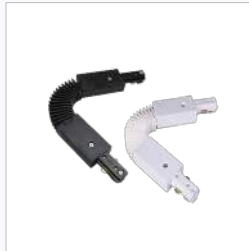
LBLT3FC FLEXI CONNECTOR