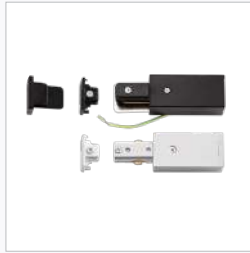
LBLT3PF POWER FEED