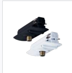
LBLT3TA TRACK ADAPTER