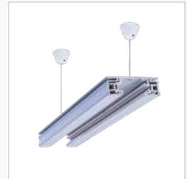
LBLT3ST SUSPENSION TRACK