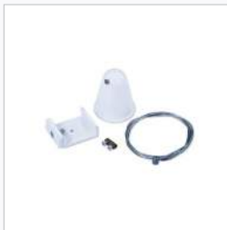
LBLT3STK SUSPENSION TRACK KIT